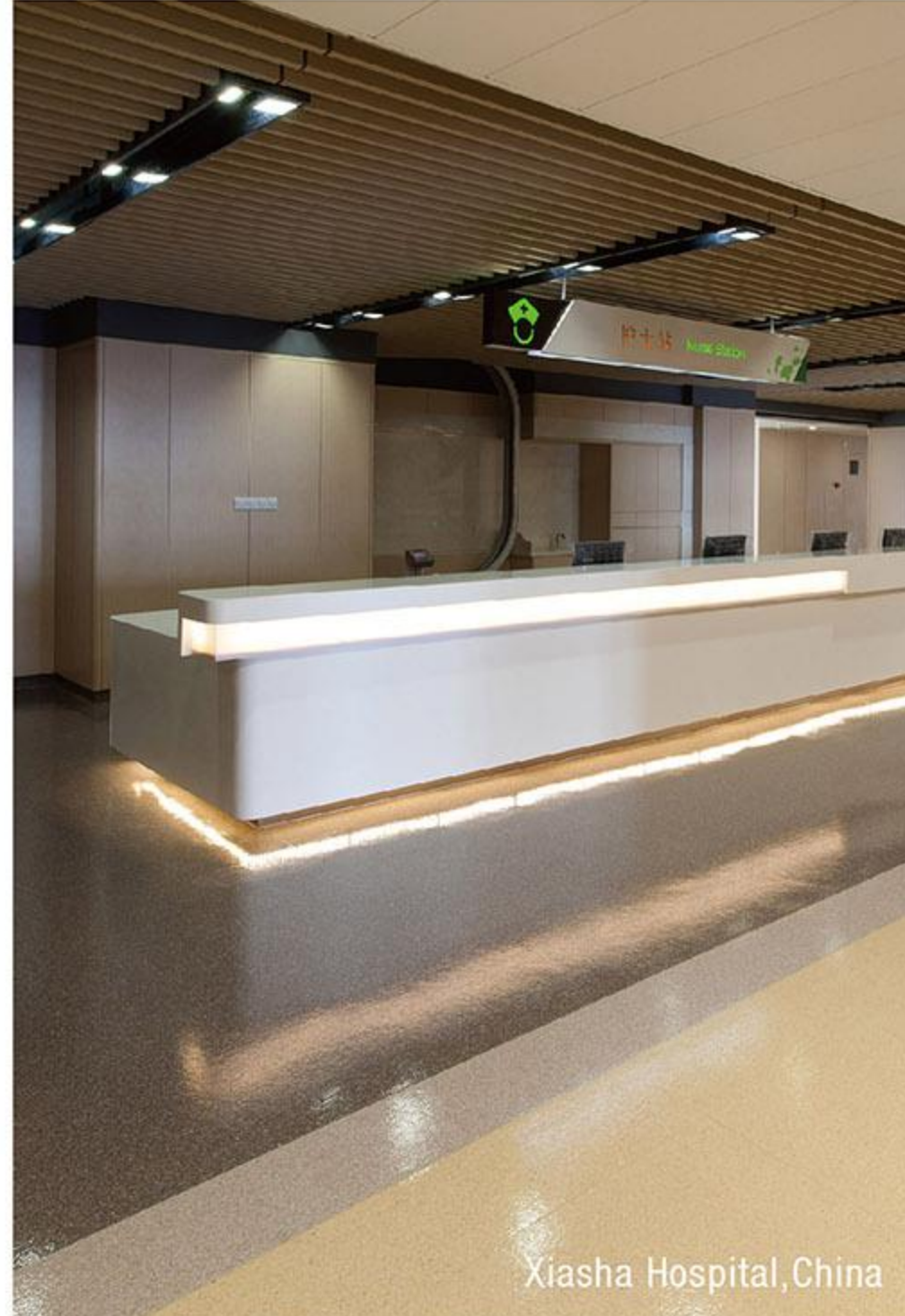
Xiasha Hospital, China